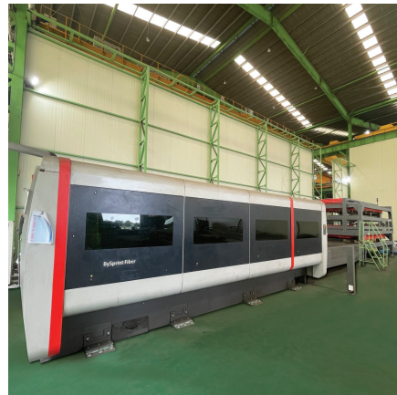
Laser cutting machine