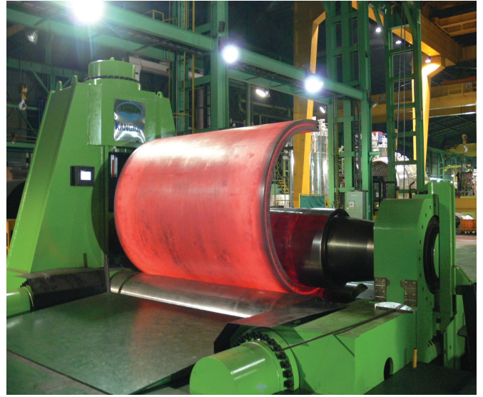
Roll bending machine