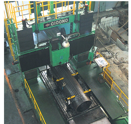
Radial drilling machine