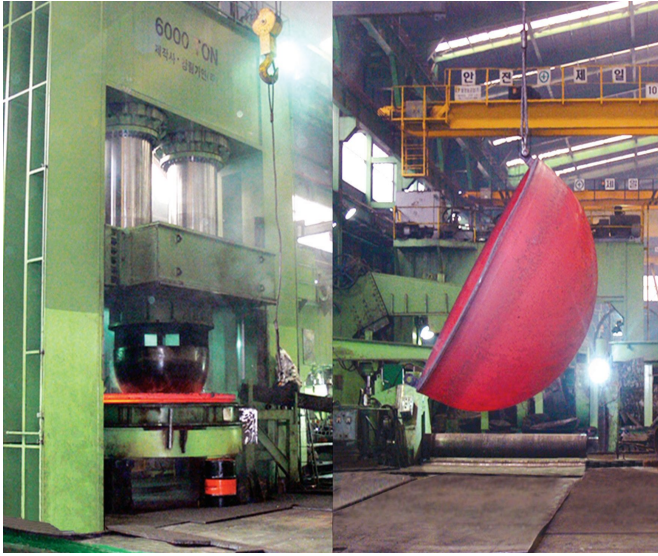
6,000 ton hydraulic press