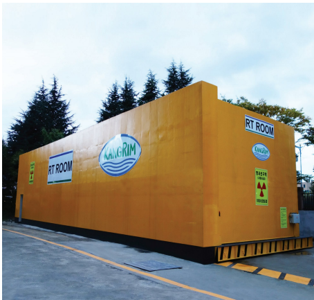
Large size RT room