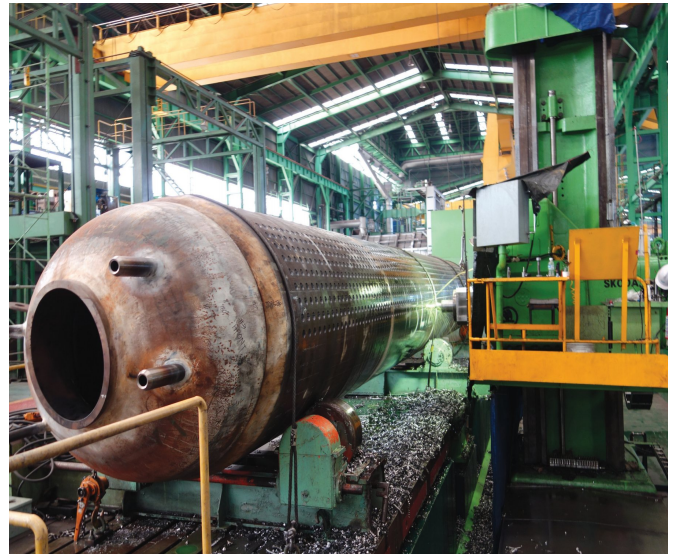
CNC horizontal boring machine