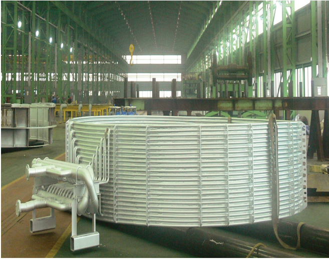
Hood for Mill Steel Factory