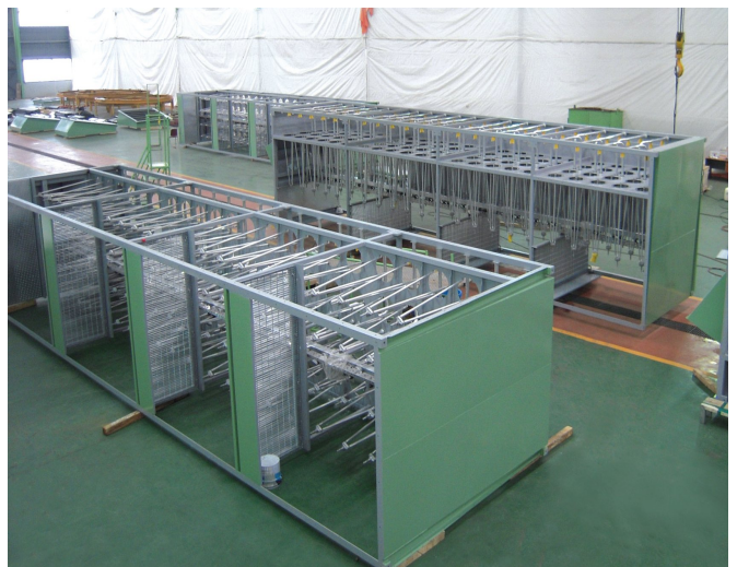
Filter Module for TGS