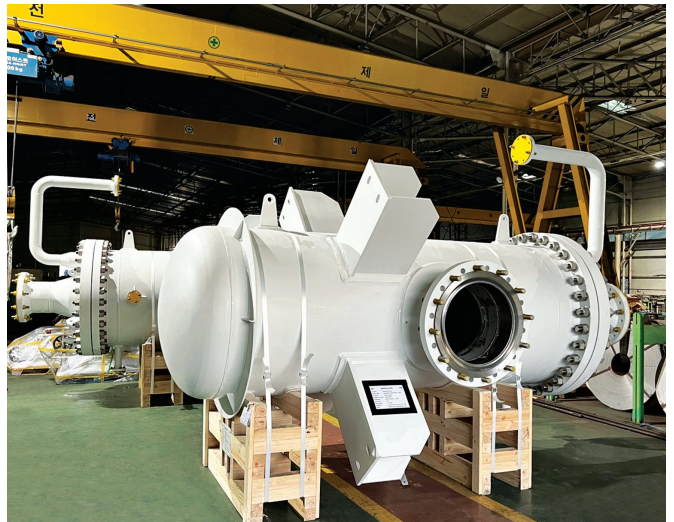
Suction Vessel for LNG Pump