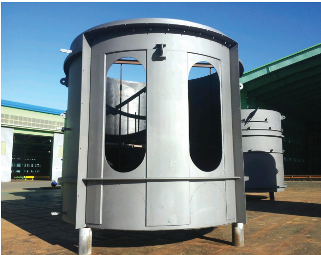
Duct for HRSG